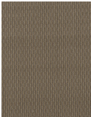
100 Bayou Beige