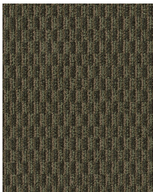
300 Hedge Row