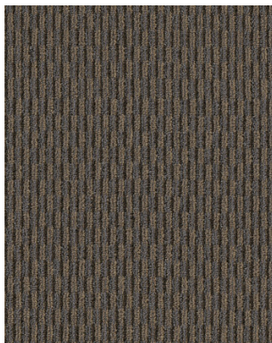
500 Wrought Iron