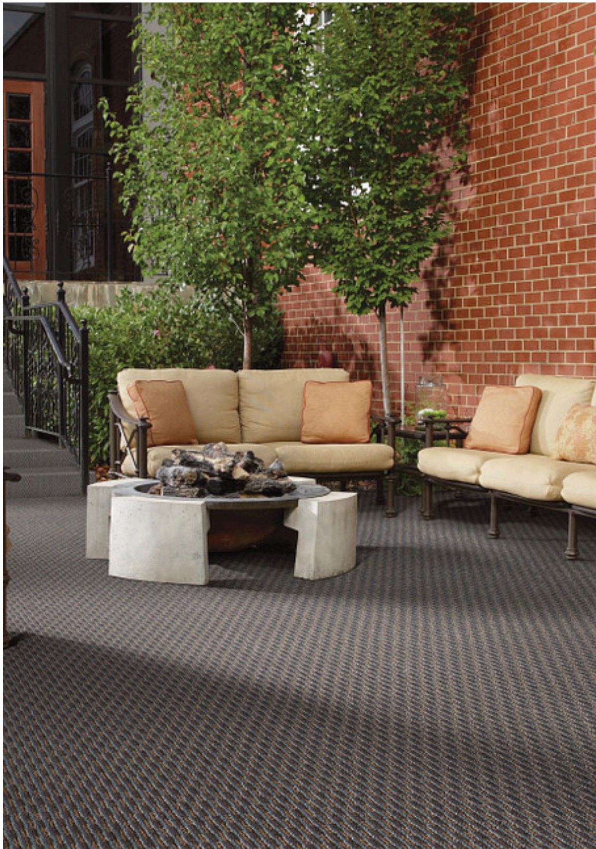
400 Tapestry Blue