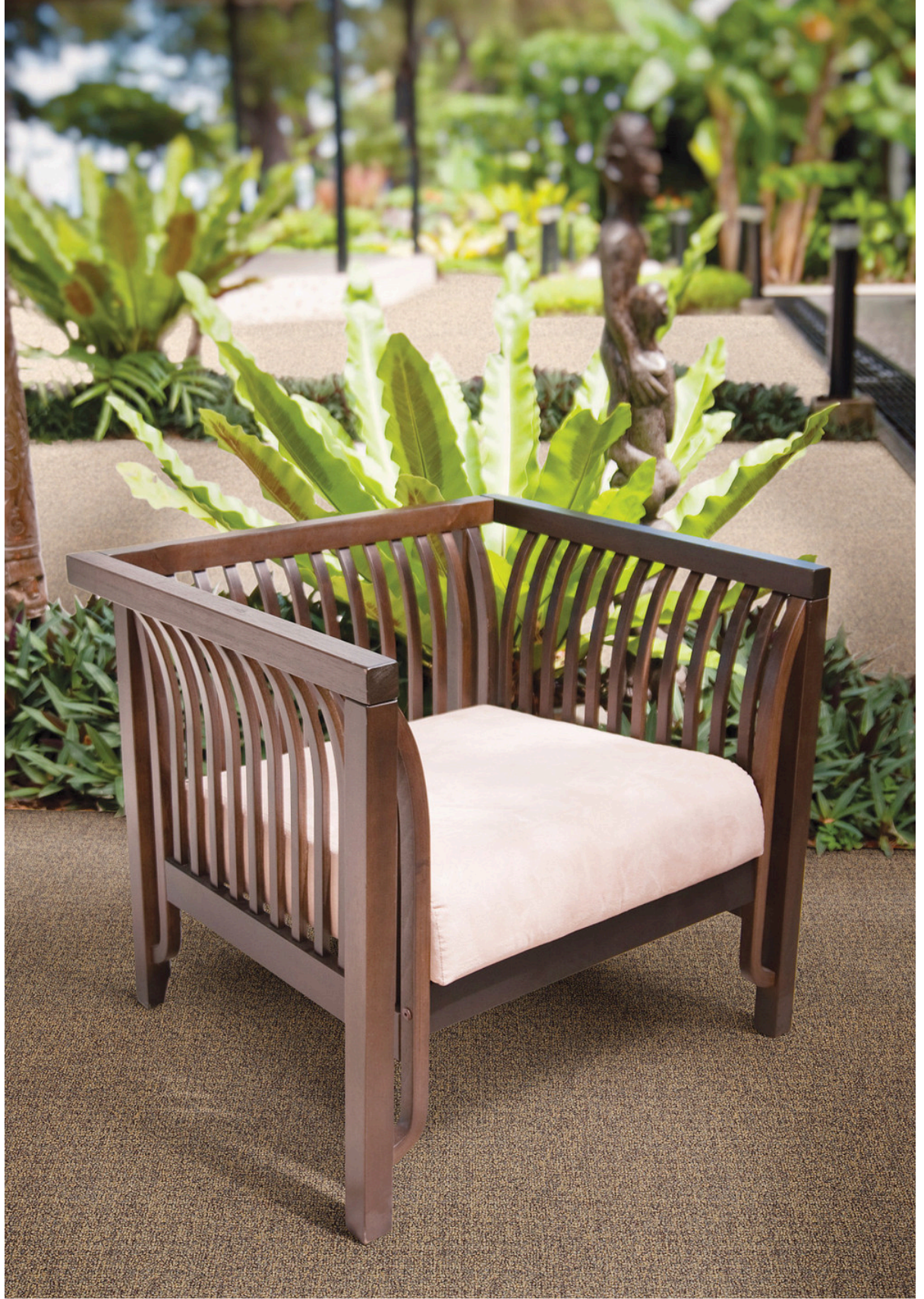
700 Natural Twine