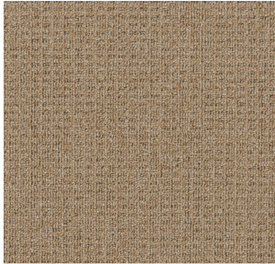
200 Straw Weave