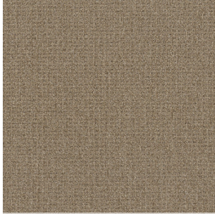
100 Weathered Teak