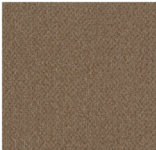
700 Tree House